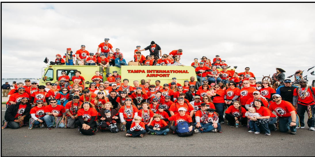
On January 24, 2015 members of TIAPD helped represent the Authority at the Gasparilla Children's Parade.

Investigator Shughart provided continuing education by conducting training for airport tenants, volunteers and employees throughout 2015. Training included Suspicious Packages, Identity Theft, Distracted Driving, and Active Shooter. The training sessions lasted approximately 45 minutes to an hour and the agency has been provided with all positive feedback from the participating audiences. Crime Prevention created an active shooter quick reference guide to hand out to the airport community during airport watch meetings and during community policing.